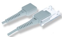
Extension cable DSUB-DSUB 120 cm Model No. 00310

Sensor extensions are optionally available.