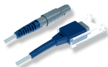
Extension cable Lemo-DSUB 150 cm Model No. 00309

Medlab medizinische Diagnosegeräte GmbH Helmholtzstr. 1a, 76297 Stutensee - Germany Tel. +49 (0) 7244 74110-0, FAX +49 (0) 7244 74110-28 sales@medlab.eu, www.medlab.eu